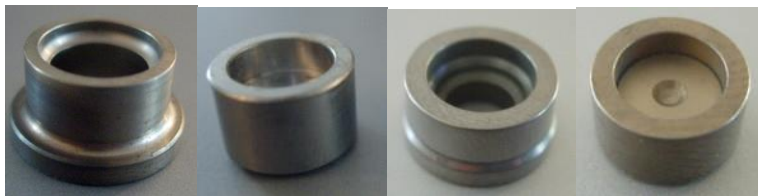
8 mm Closer 8 mm Opener 7 mm Closer 7 mm Opener

Below are pics of the 8 mm and 7 mm closer and opener shims